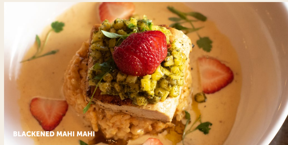
BLACKENED MAHI MAHI