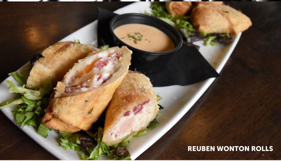
REUBEN WONTON ROLLS